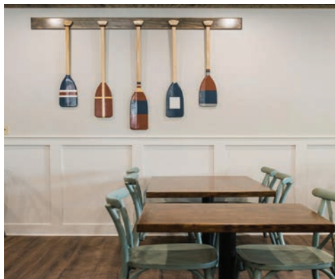
The interior of Crepe & Custard is lake-themed with canoe paddles hanging on the wall.